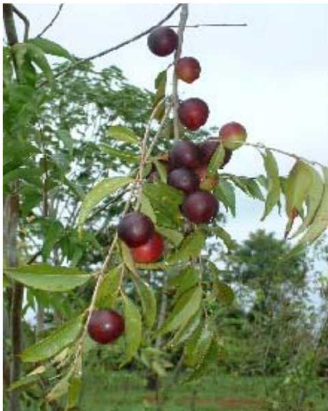
Camu Camu Berries

In addition chocolate may reduce oxidation of dangerous LDL cholesterol. In moderation it has been shown in a study to increase longevity, 2 and we all know the active mood-altering effects of this favorite treat. It acts as a mild aphrodisiac as well as helps fight depression. Scientists at the Neurosciences Institute in San Diego discovered that biologically active ingredients of chocolate also target a substance in the brain known to produce “internal