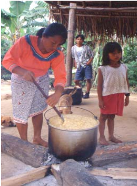
Native Shipibo Woman Cooking