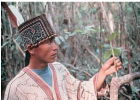
Shipibo Shaman with Amazon Herb